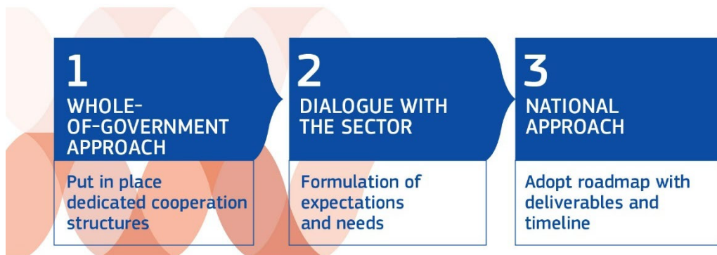
Figure 3: Steps towards the development of a national approach

Although the systems and starting positions differ from country to country and no blueprint can be prescribed, some general observations can be made about how Member States tend to start organising their national processes to address research security.