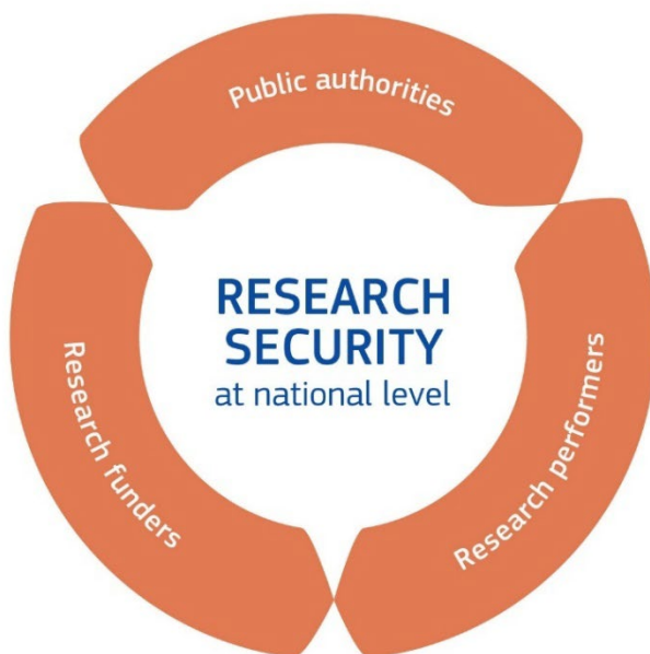
Figure 1: Main actors for research security at national level

At national level, public authorities, research funders and research performers are specifically addressed, underlining the fact that this is a collective endeavour where each governance level has a specific contribution to make.