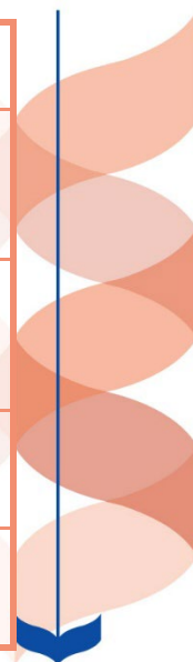
Figure 2: Research security policy maturity model

When applying the maturity levels, there can be differences between countries as well as within countries, with some governance levels or parts of the R&I ecosystem being more advanced than others.